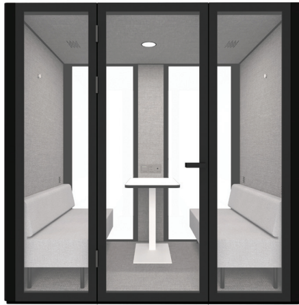
Front View with Door