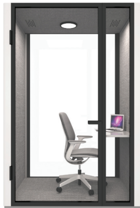
Front View with Door