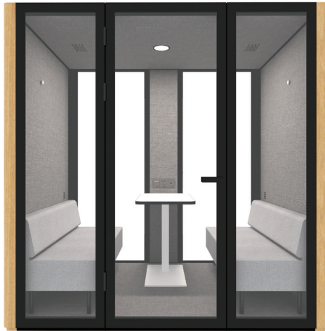
Front View with Door