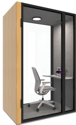
Custom Order Only