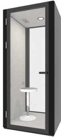
SKU: BQ-SPOD BL-GP18-BK