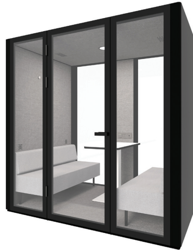
SKU: BQ-MPOD BL-GP18-BK