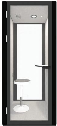
Front View with Door